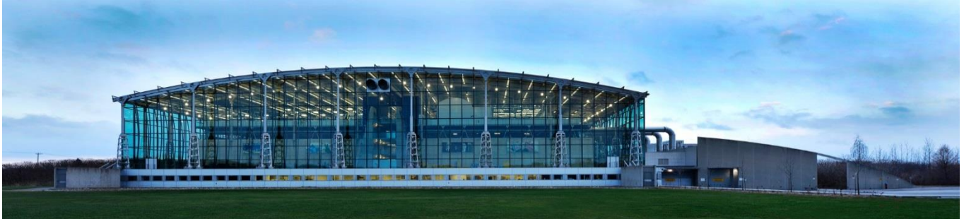
The Library and Archives Preservation Centre, world-renowned for its cutting-edge preservation technology