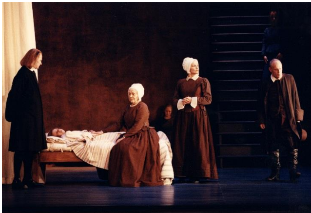
Photo: The play Les sorcières de Salem, R13877-116-X-F.

Before being acquired, documents will be assessed by our archivists on the basis of selection criteria and our acquisition policy. To submit your donation offer, please provide a brief description of the materials you wish to donate. This description could include the number of boxes, the list of titles and the date of the materials, as well as an overview of their