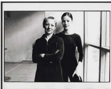
Photo: Celia Franca and Karen Kain, dancers and artistic directors of the National Ballet of Canada, R7959-723-5-E.