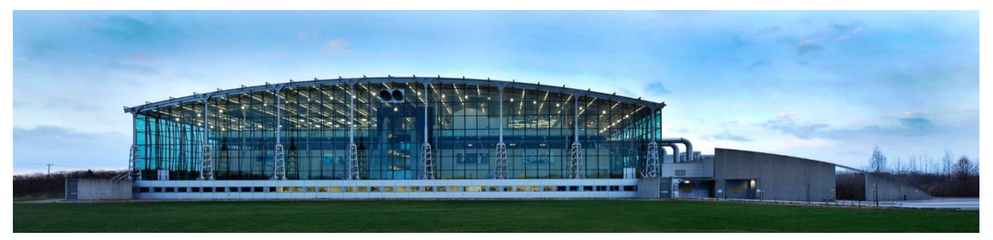
The Library and Archives Preservation Centre, world-renowned for its cutting-edge preservation technology